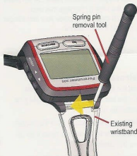
Spring pin removal tool